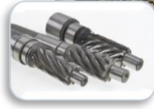
COMPA - JTEKT