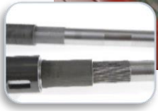
COMPA - FUJI KIKO