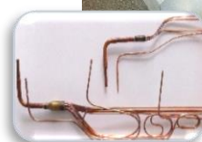
COMPA - DAIKIN