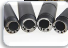
COMPA - DELPHI