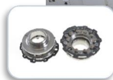
COMPA - GARRETT