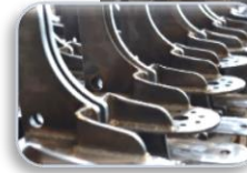
COMPA - HAULOTTE